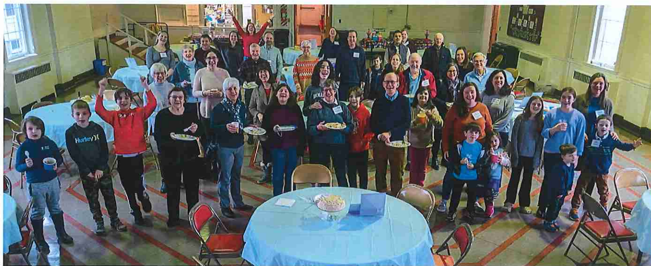
From Birthday Sunday, January 2024